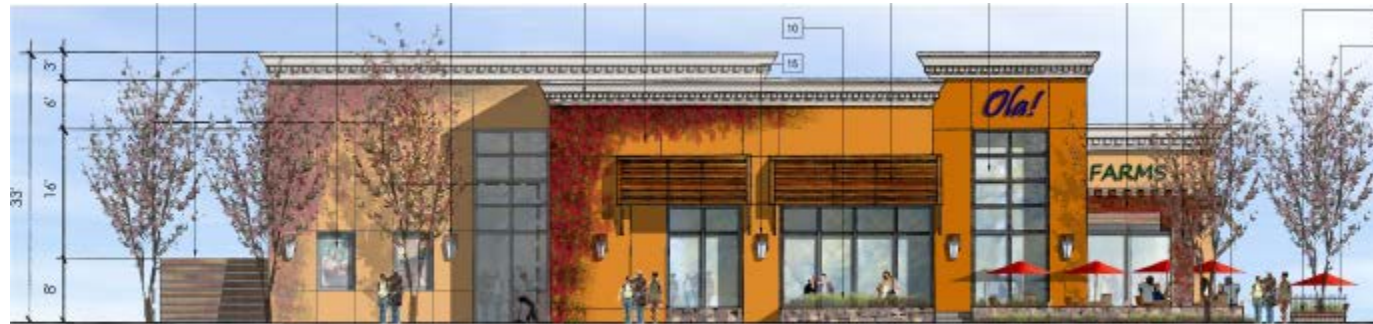
THIRD STREET ELEVATION