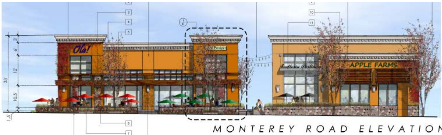
MONTEREY ROAD ELEVATION